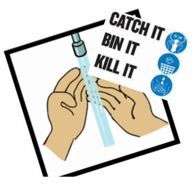
We will continue with strict hygiene routines

Children will have their own, personal work pack