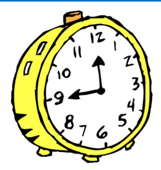
Start and finish times will be staggered. Please stick to them (see back of leaflet)

Before and After-School Club <u>WILL</u> be running. Please book in advance (from 1.9.20) by ringing school. You must have credit on ParentPay to do this.