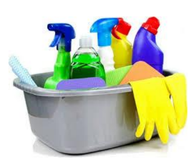
Cleaning in school will be thorough and toilets cleaned throughout the day