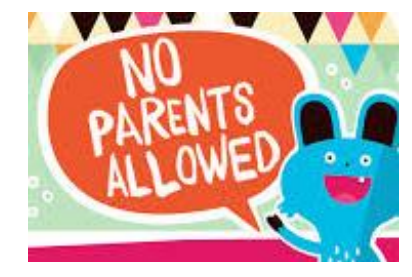
Adults will only be allowed in school on an emergency basis and KS2 parents will not be on the playground in the mornings