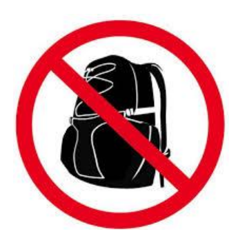
Children won't need to bring in bags daily, to start with

A FREE P.E. kit will be provided to pupils eligible last year. They will stay in school. Pupils need to bring trainers and a tracksuit to add to the free kit.